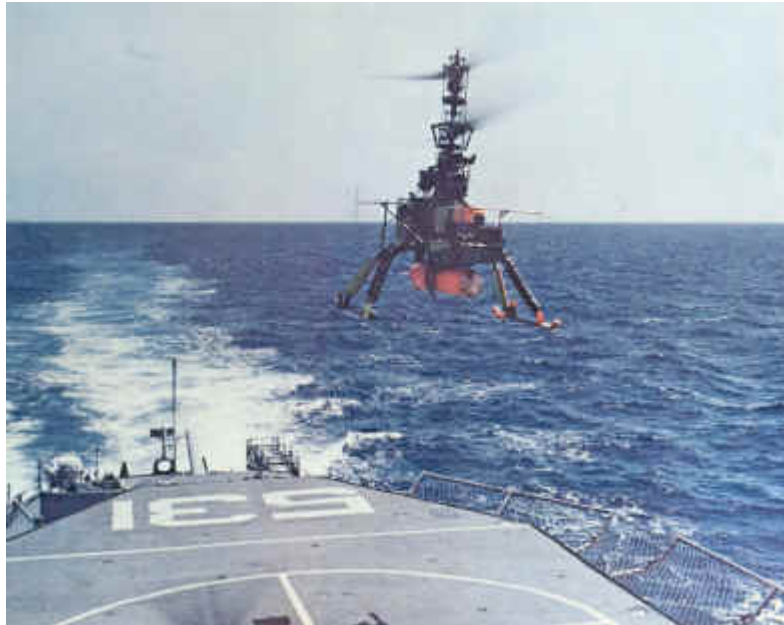
Figure 1. QH-50A departs from USS Hazelwood, December 7, 1960 1

The DASH program was under constant scrutiny from Naval Aviators who felt that an unmanned aircraft would eventually replace manned aircraft. By direction of Secretary of Defense McNamara, all U.S. Navy DASH program operations ended on November 30, 1970. 2